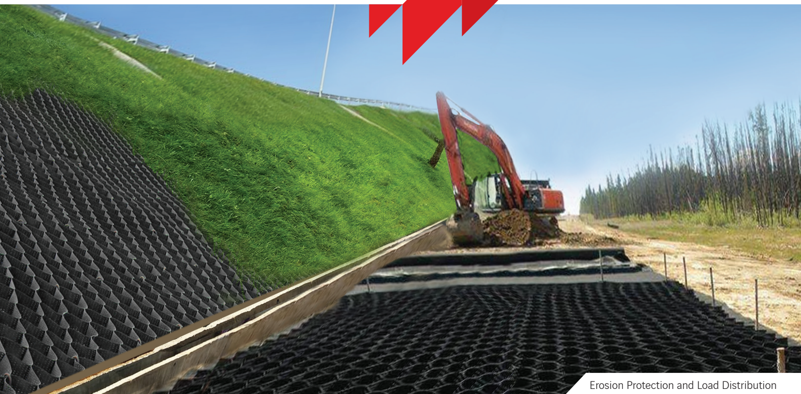
Erosion Protection and Load Distribution